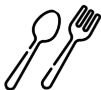
Single-use plastic cutlery