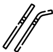
Single-use plastic straws & stirrers

Queensland businesses are not allowed to supply: